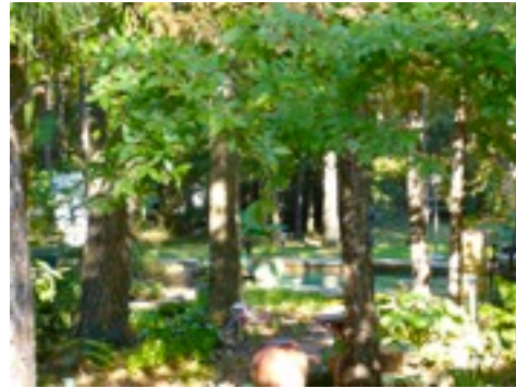
OCTOBER: 40802 PIPESTONE