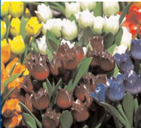
Cimarron Country POA

Please note: Articles in this newsletter express the opinions of their authors and do not necessarily reflect the opinions of the Cimarron Country Property Owners' Association, the Board of Directors or the Cimarron Country Newsletter Editor. The CC Board of Directors and the Editor assume no responsibility.