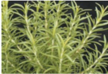
Rosemary, BBQ Herb Perennial

Height: 2 to 4 feet Width: 1 to 2 feet Flower Color: Azure Light Requirement: Full Sun Soil: well-drained Bloom Season: May through November Ideal Planting Time: Spring through Fall Cold Tolerance: Cold Hardy to 15 degrees Hard to Kill: Yes Special Attributes: Drought Tolerant