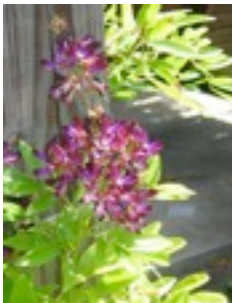
Evergreen Wisteria Perennial Vine

Height: to 20 feet or more Light requirements: Sun Soil: Rich With loam, rich humus Bloom Season: July to September Ideal Planting Time: Fall to Spring Cold Tolerance: Root hardy, regrows in Spr. Special Attributes: Drought Tolerant