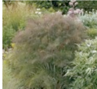
Fennel, Bronze Herb Annual

Height: 2-3 feet Width: 2-4 feet Flower Color: Yellow Light Requirement: Full Sun Bloom Season: May-June Ideal Planting Time: October to January Cold Tolerance: Down to 27 degrees** Special Attributes: Drought Tolerant