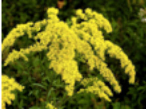
Goldenrod Perennial Flower

Height: 3 Feet Width: 3 Feet Flower Color: Gold/Yellow Light Requirements: Full Sun to Partial Shade Bloom Season: August to November Ideal Planting Time: Spring to Fall Cold Tolerance: Cold hardy to 0 degrees Hard to Kill: Yes Special Attributes: Drought Tolerant , disease resistant, attracts butterflies