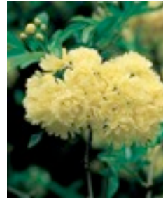
Rose 'Lady Banks' (yellow) Rose Climber

Note: Many think that this plant causes allergy problems - it does NOT. The cause of problems is a similar plant called "Ragweed".